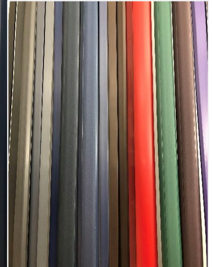
Airbus Color Codes AIC 29.*